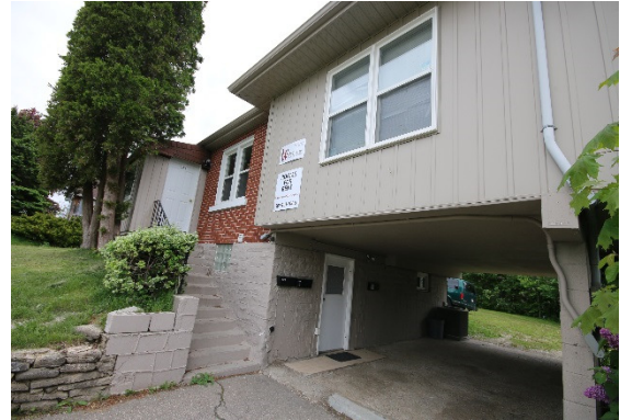
Image 2: Lower Unit B entrance with landlord's mailbox to the right of the door.